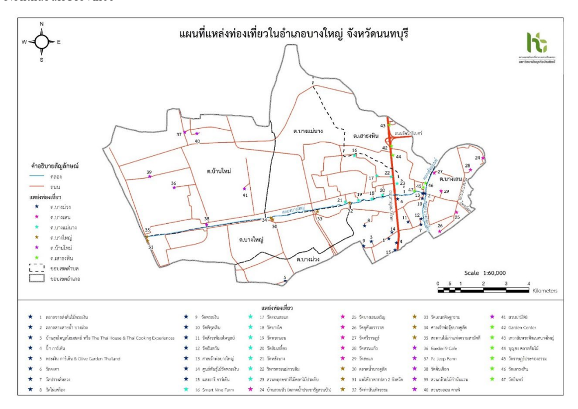
Figure 2 Map showing the distribution of tourism resources or tourist attractions in Bang Yai District. Nonthaburi Province

•Potential and resources available for marketing communication in the Bang Yai District, Nonthaburi Province